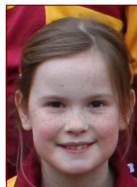
Ellie, Molly and Isabel were absent for the team photograph, but were important members of their Under 11 and Under 10 teams