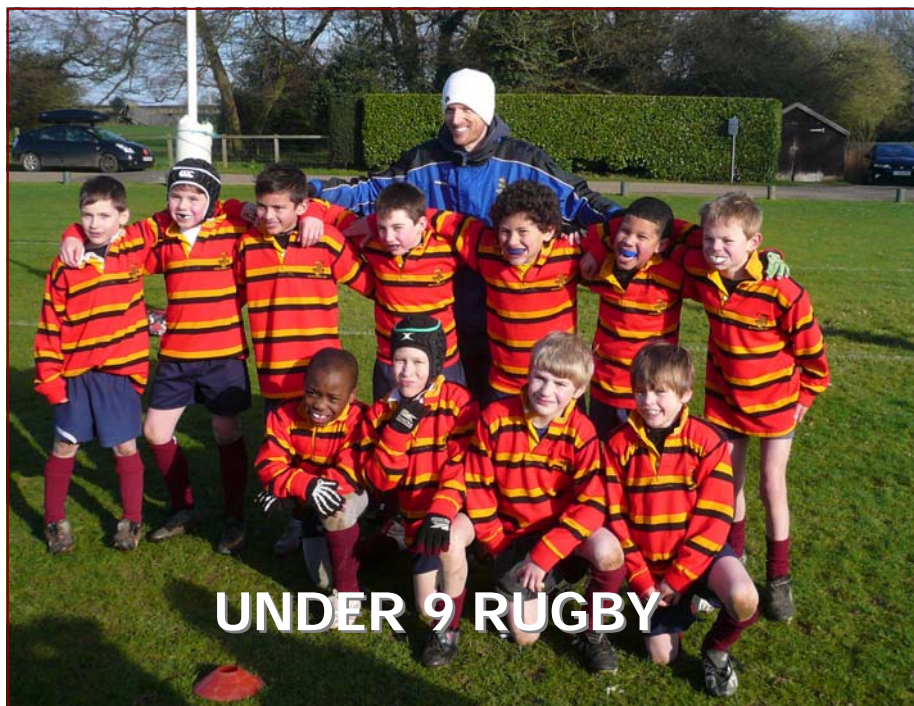
UNDER 9 RUGBY