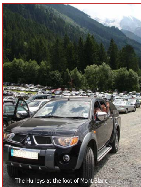
The Hurleys at the foot of Mont Blanc