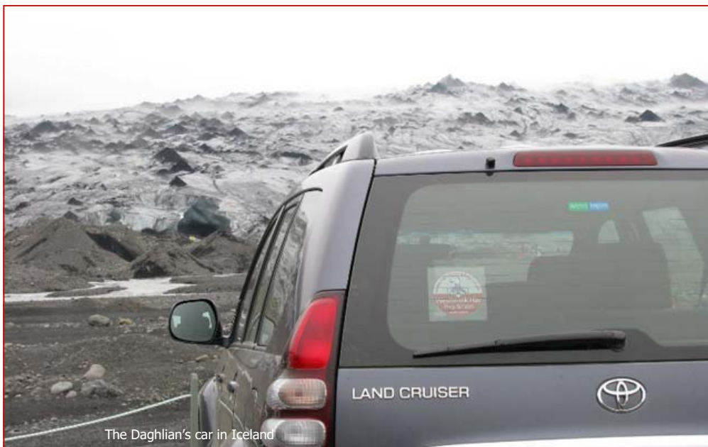
The Daghlia's car in Iceland