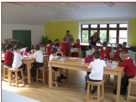
Year 1 in the new Art Room