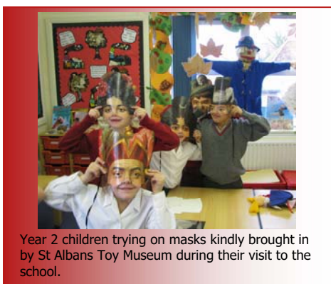
Year 2 children trying on masks kindly brought in by St Albans Toy Museum during their visit to the school.