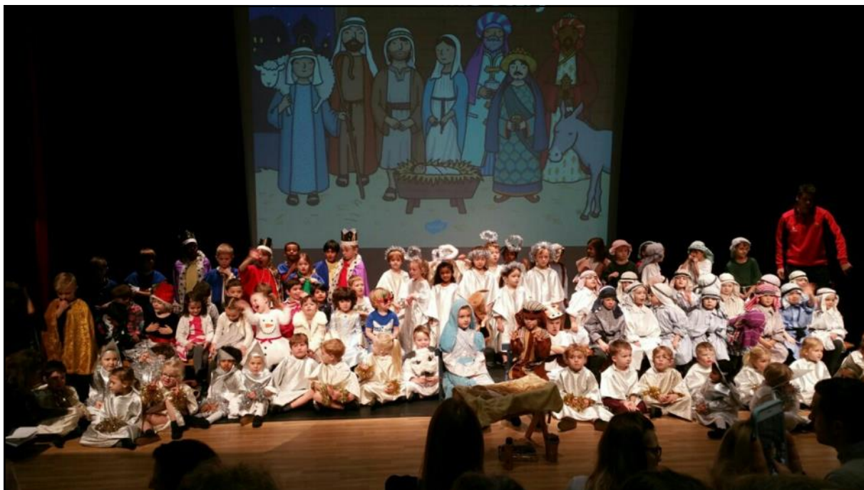
The term ended with the Lower School children holding their Nativity Assembly in the new Performing Arts Centre.